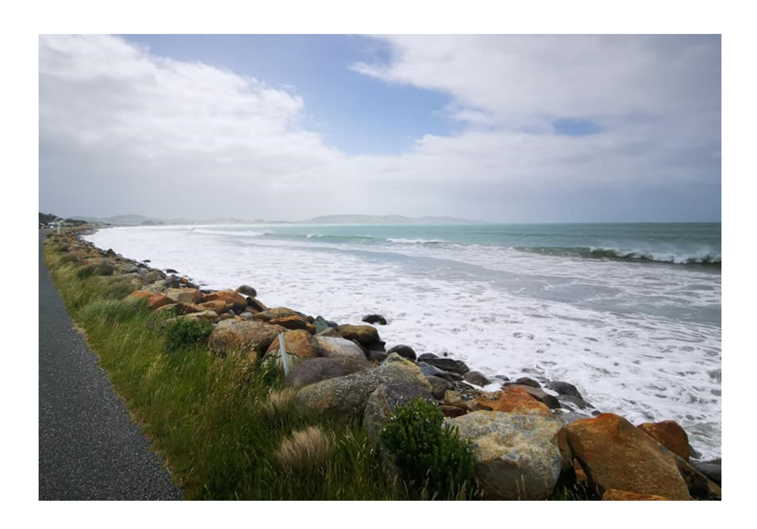
Surf's up - Foreshore Road; Colac Bay.

"Ehara taku toa, he takitahi, he toa takitini." My success should not be bestowed onto me alone, As it was not individual success but success of a collective.