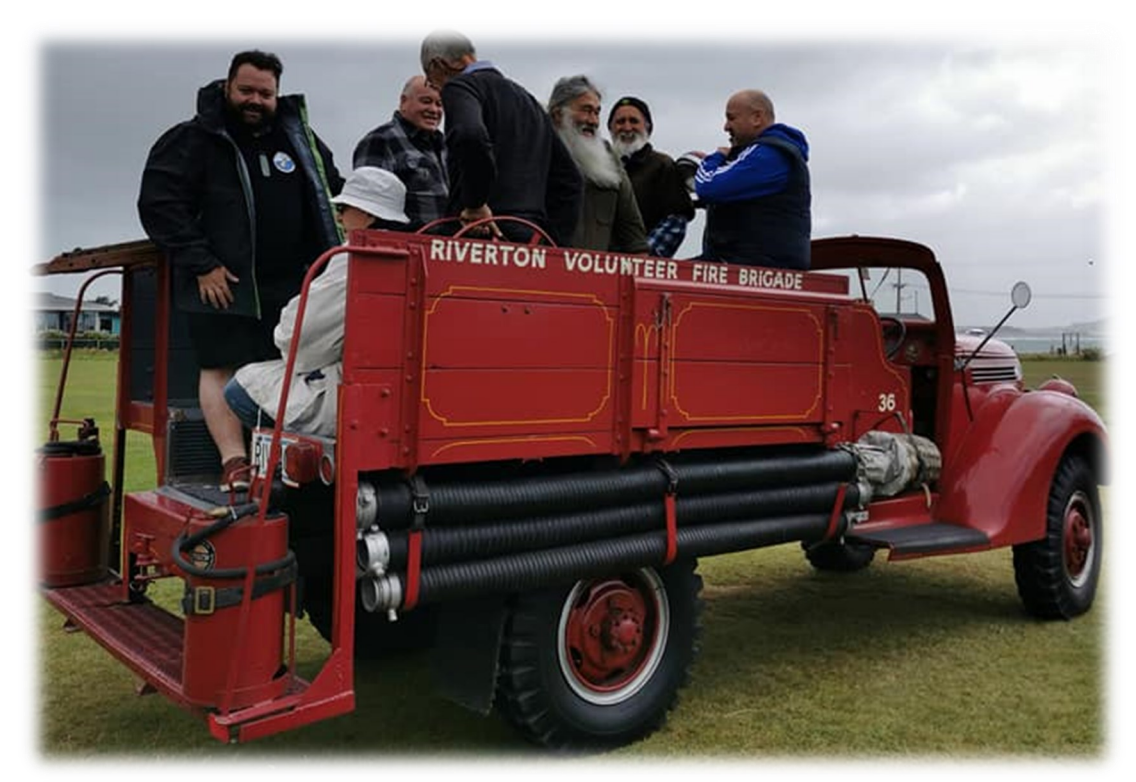
Loaded and ready to ride. The Riverton Volunteer Fire Brigade treated whanau to a spin on this grunty classic fire engine!