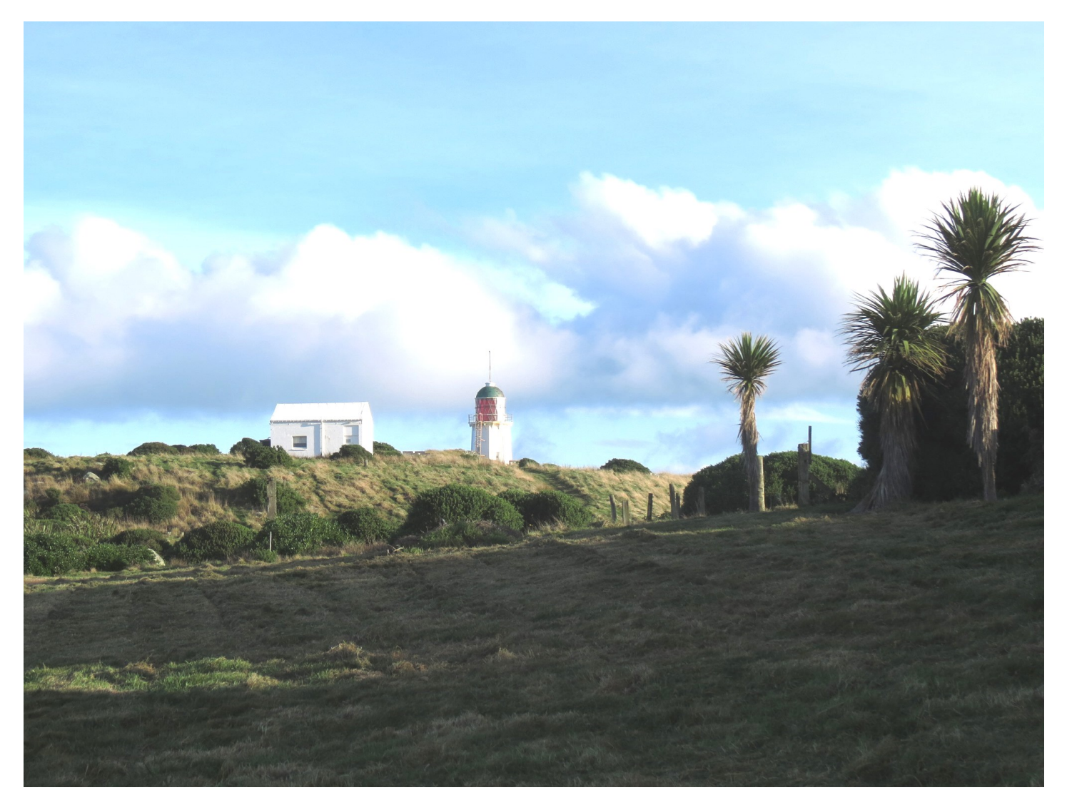
The lighthouse and lighthouse keepers hut on Rarotoka.