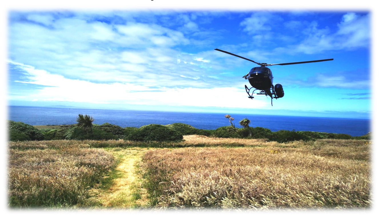
Below: A stunning aerial view - by drone - of the drive to TARAMEA (Howell's Point).

We are forever grateful for their dedication and hard work.