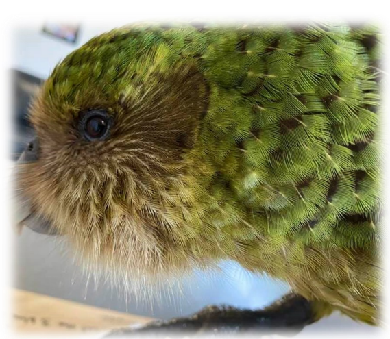
A close up of one of our precious Taonga species - Kakapō - on Whenua Hou.