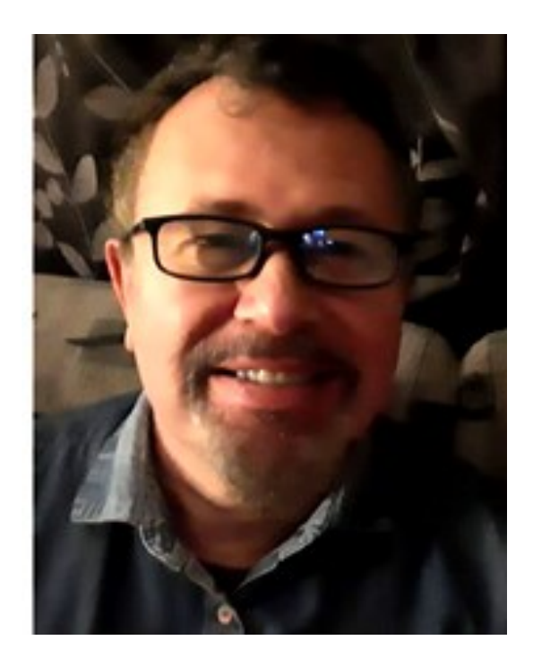
Kia ora koutou, ka mihi o te tau kua pahure nei.